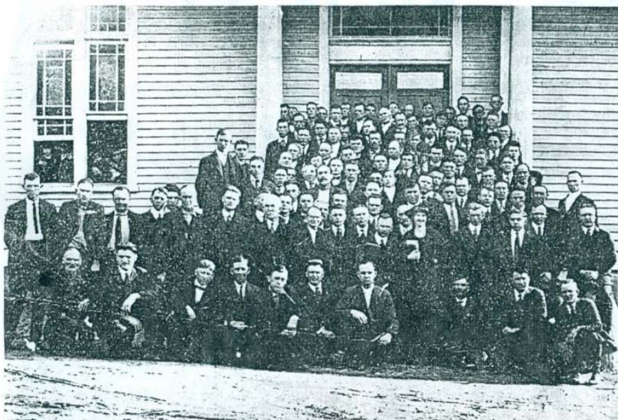
Picture made around year of 1903. The Methodist Church, in 1921 remodeled its building, had a total membership of 354. Sunday School enrollment 430, average attendance of 300. Men's Bible Class averaged 50 and sometimes 100 present. The Cradle Roll, 126 on roll, four organized missionary societies, The Woman's Class, 50 members, The Cyrus Dawsey Young Peoples', 60 members, The Juniors, 93 members, and the Baby Division, 24 members. The Epworth League, 40 members. Average attendance at prayer meeting, 50 to 70. The church had an organized choir of Seniors and Juniors.