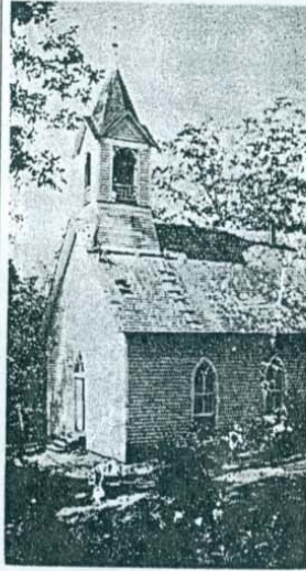
Caton's Grove Church

The reunion was attended by relatives from near and far, the farthest coming 1000 miles for the event.