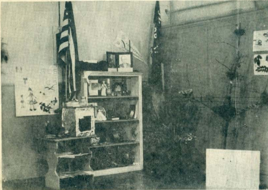
Photo of the Girl Scout Booth, re-set after it was on display at the Piedmont Interstate Fair, showing the 11 program fields of girl scouting.