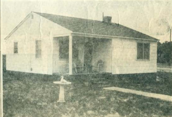
Carl and Mary McSwain and their two little sons live in calling distance from Mom and Daddy, also in a new four room house just completed.

Of course the kitchen is modern with built-in cabinets and all conveniences. We found Winnie canning pears and getting things in order.