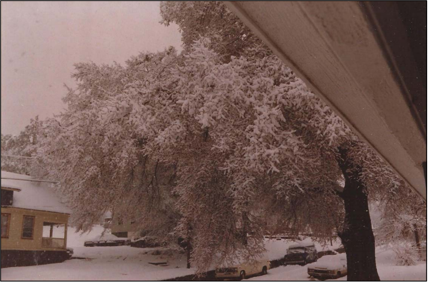
Another close up of same tree, looking at the drooping branches and across Green St.