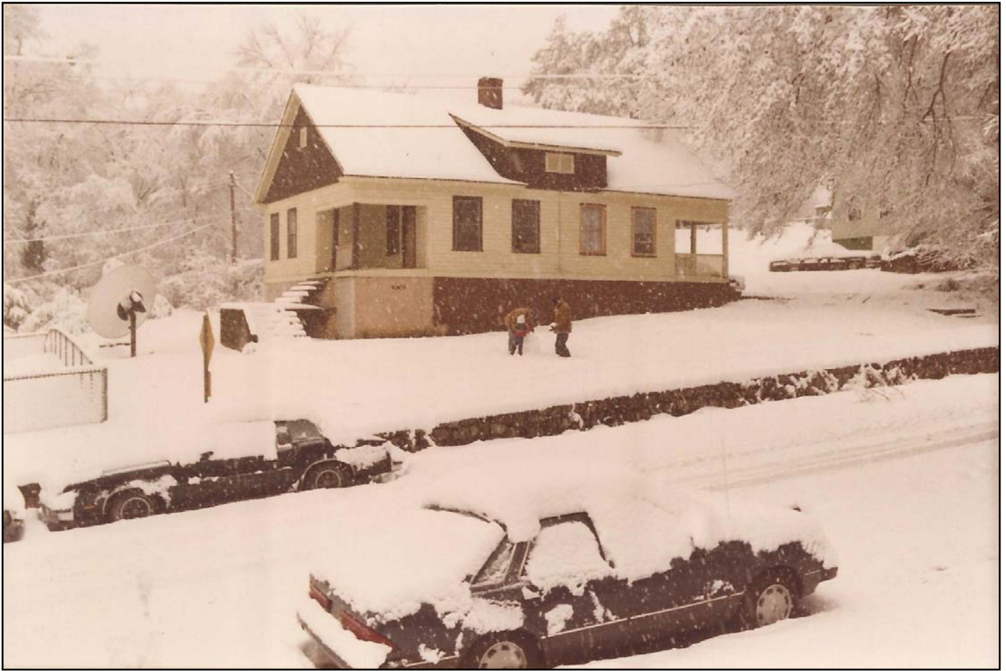
Another view looking across Green St.