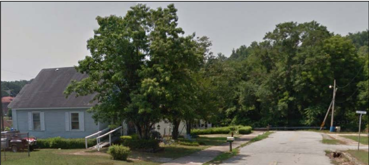
Next door house looking South down Green St as it is today.