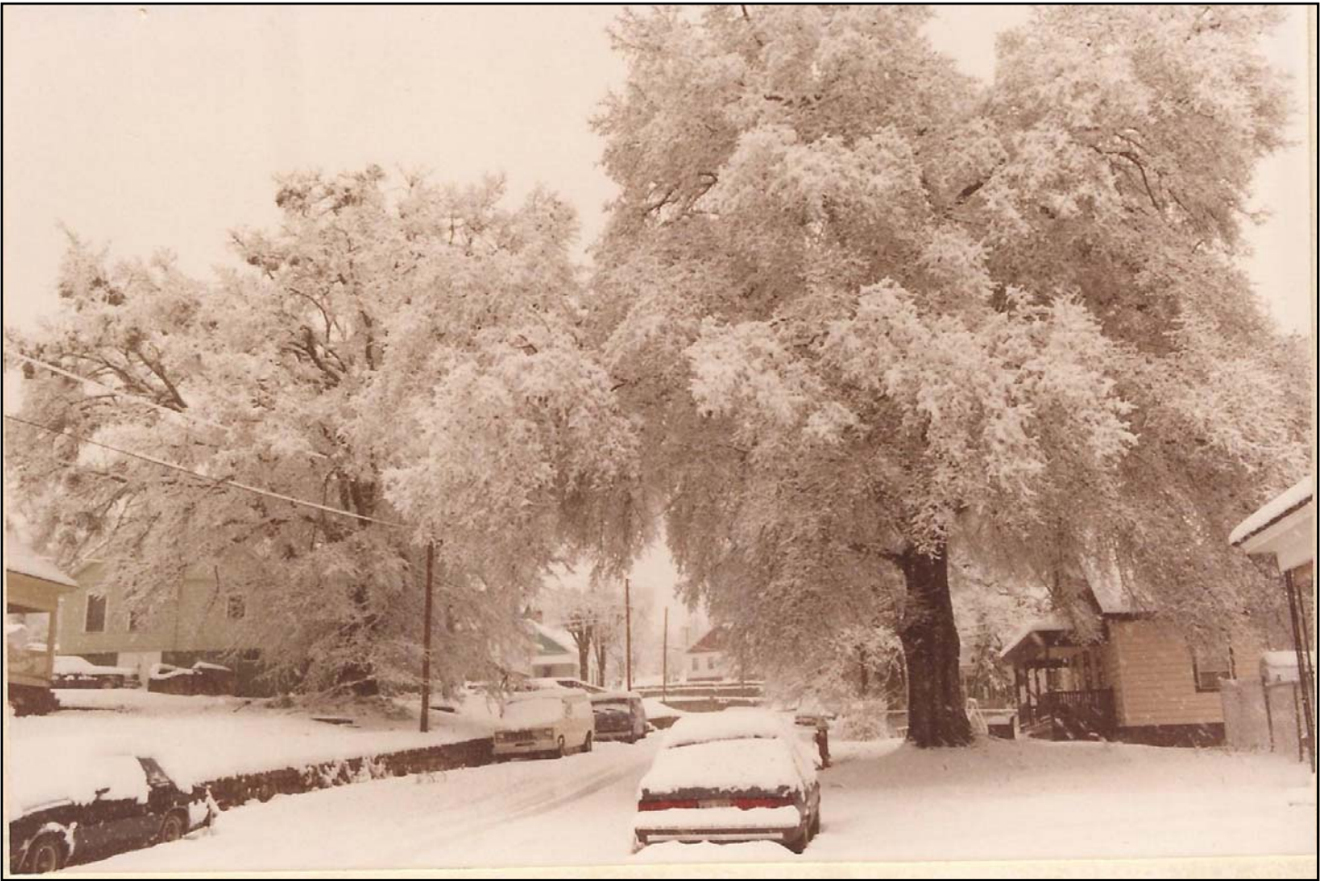
Another photo thought to be from the March, 1960 snow. Looking North up Green St. House in middle of picture is across the intersection with Chapel / Cook Drive.