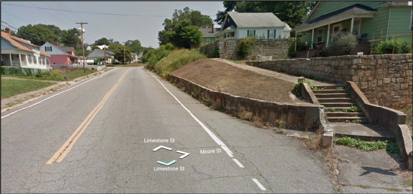
Approximate location of stranded car as it looks today.