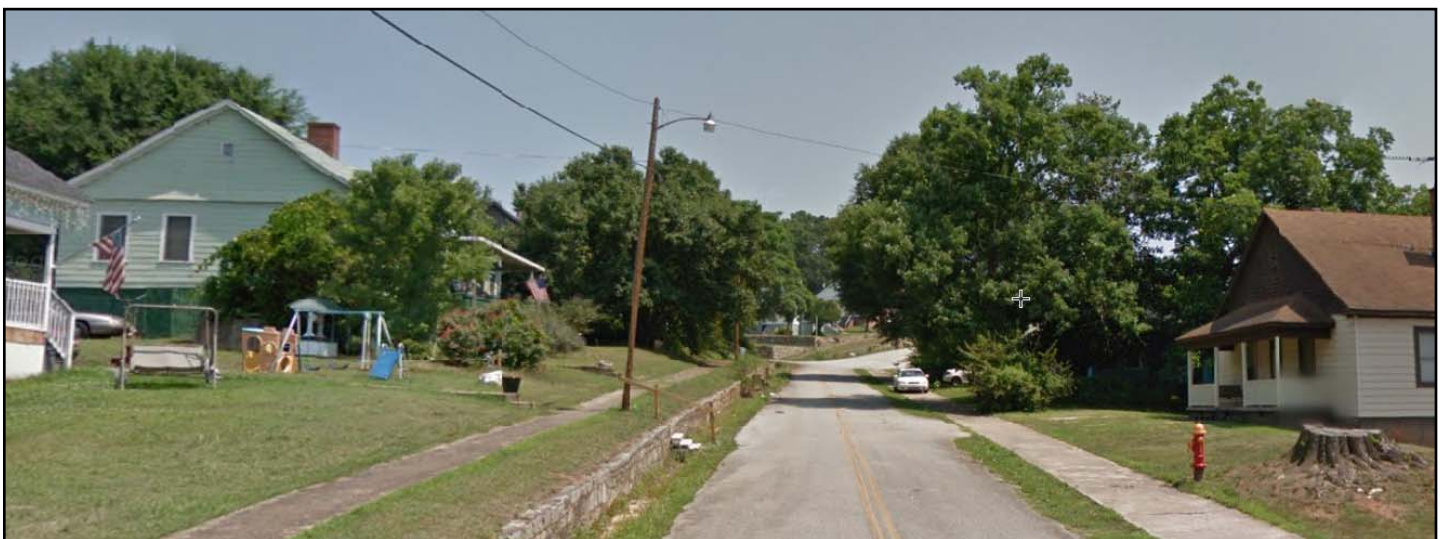
Approximate location as it looks today. Note the stump of the large oak tree at the right.