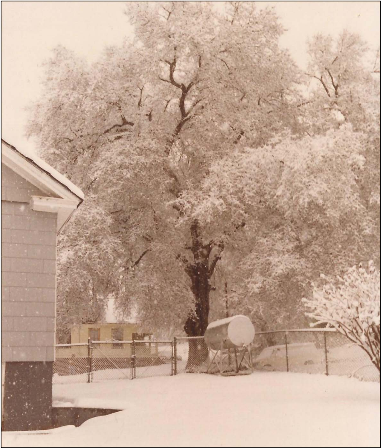
View of tree shown on page 8 taken from a different angle.