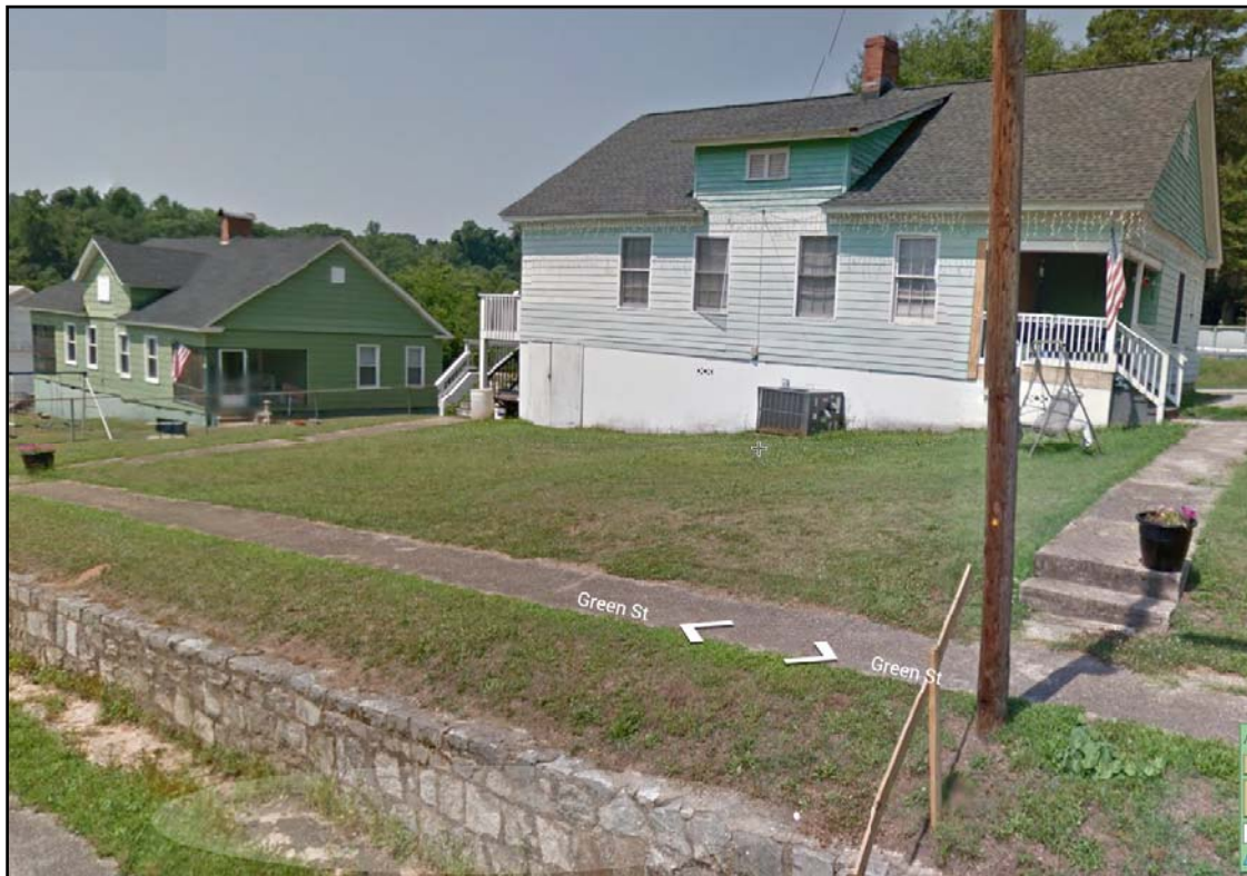
Houses across Green St. as they look today.