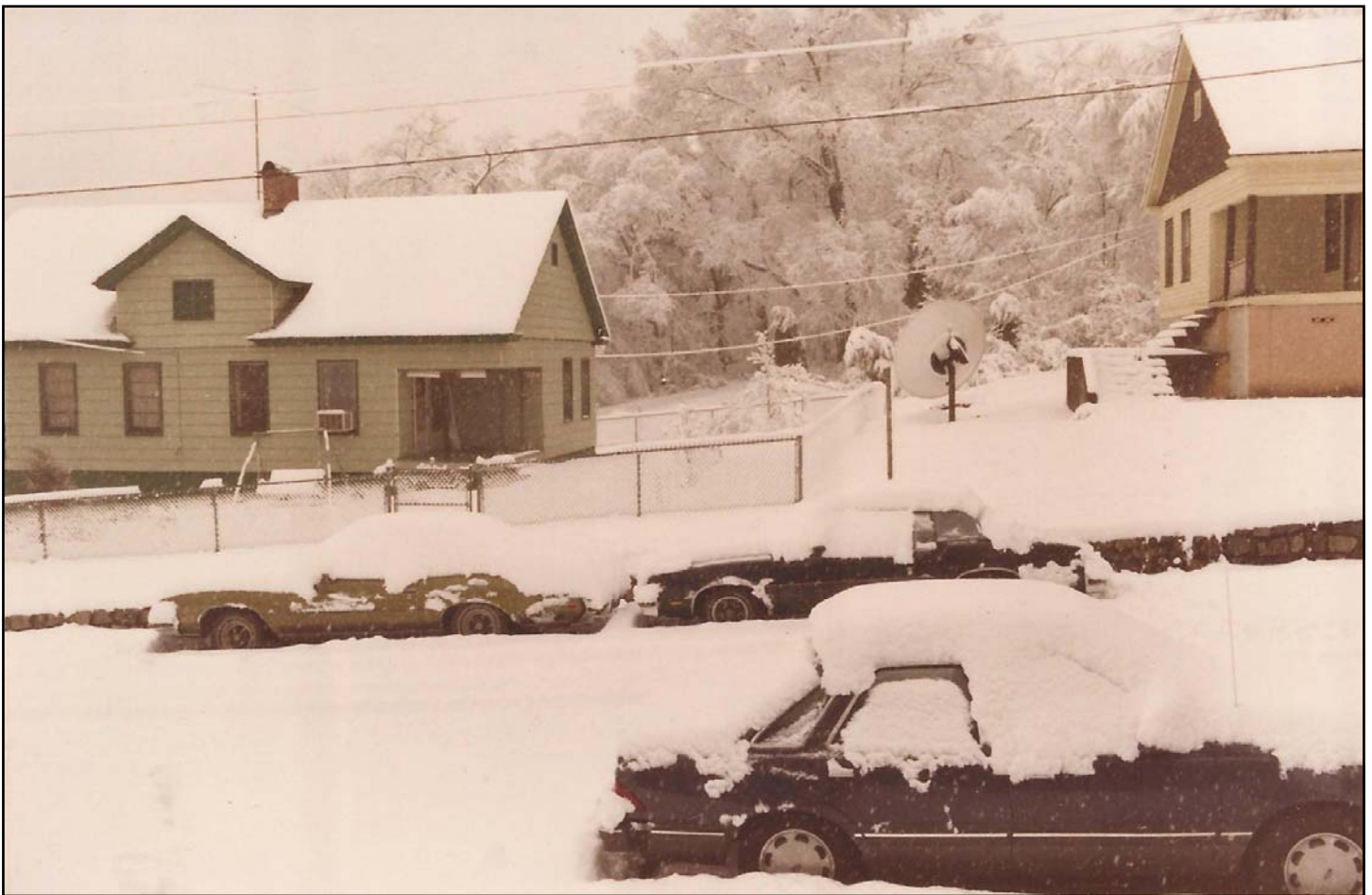
Looking across Green St. Approximate view as it looks today is shown on page 12.