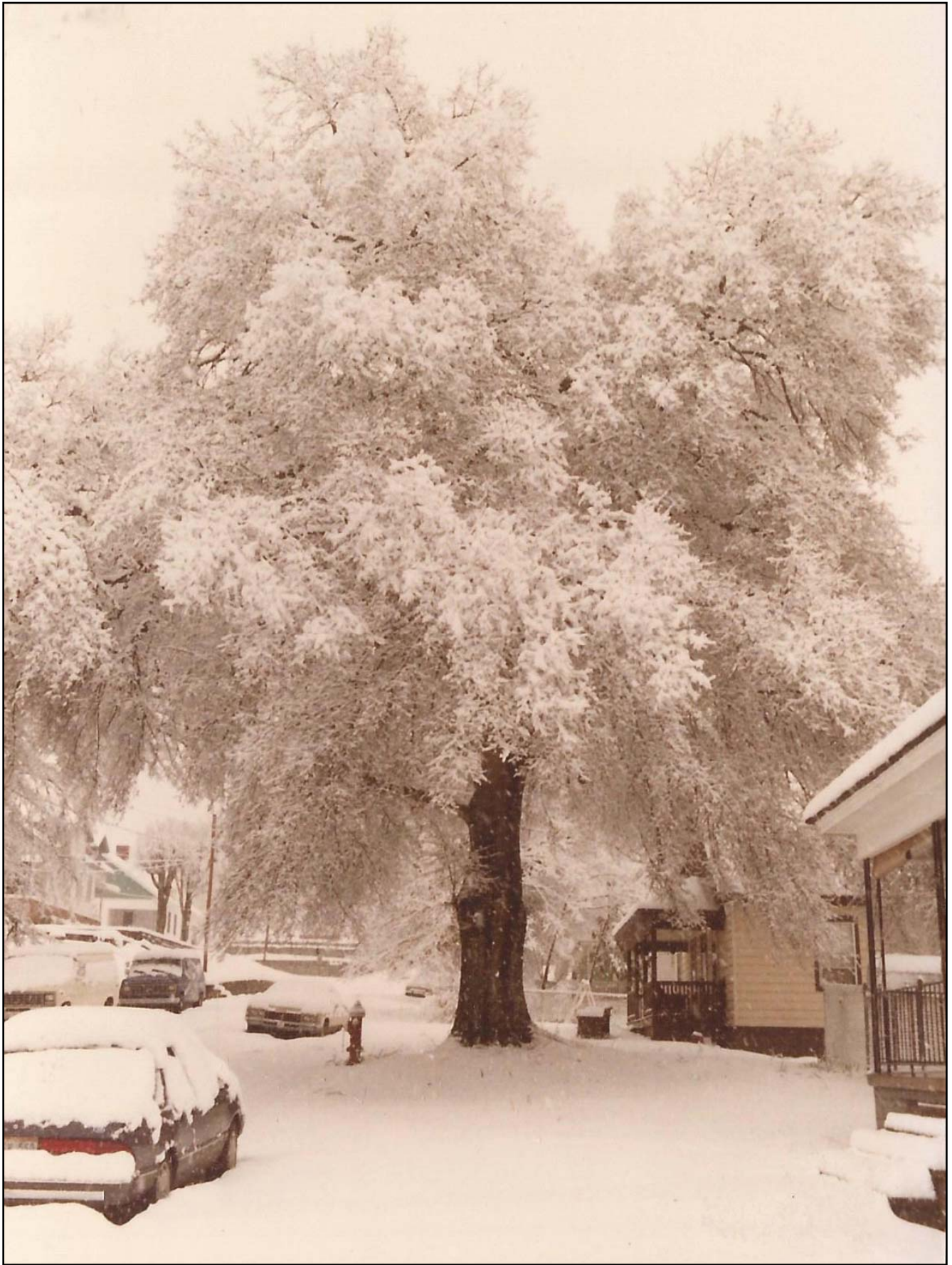
Another view looking North up Green St. Tree is no longer there. Its stump is shown in photo on page 7.