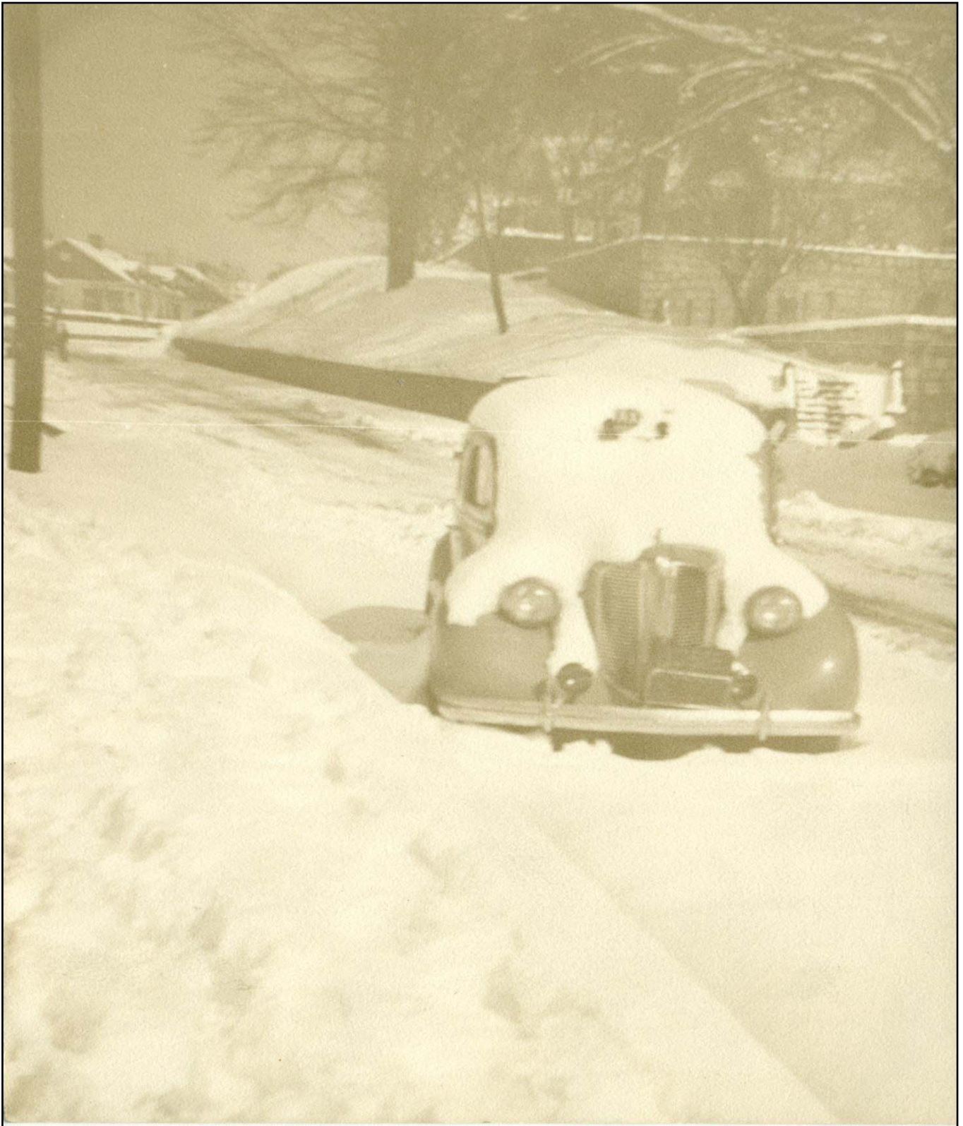
This photo was made in the 1930's or 40's. This stranded car was parked in Limestone Street in front of Montgomery Memorial Methodist Church . The approximate location as it appears today is on the next page.