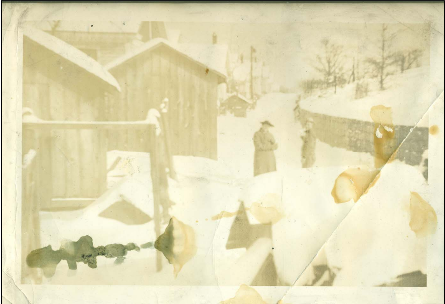
Old picture thought to be from the 1920's. Believed to be made in the "back road" that ran between Limestone Street and Moore Street.