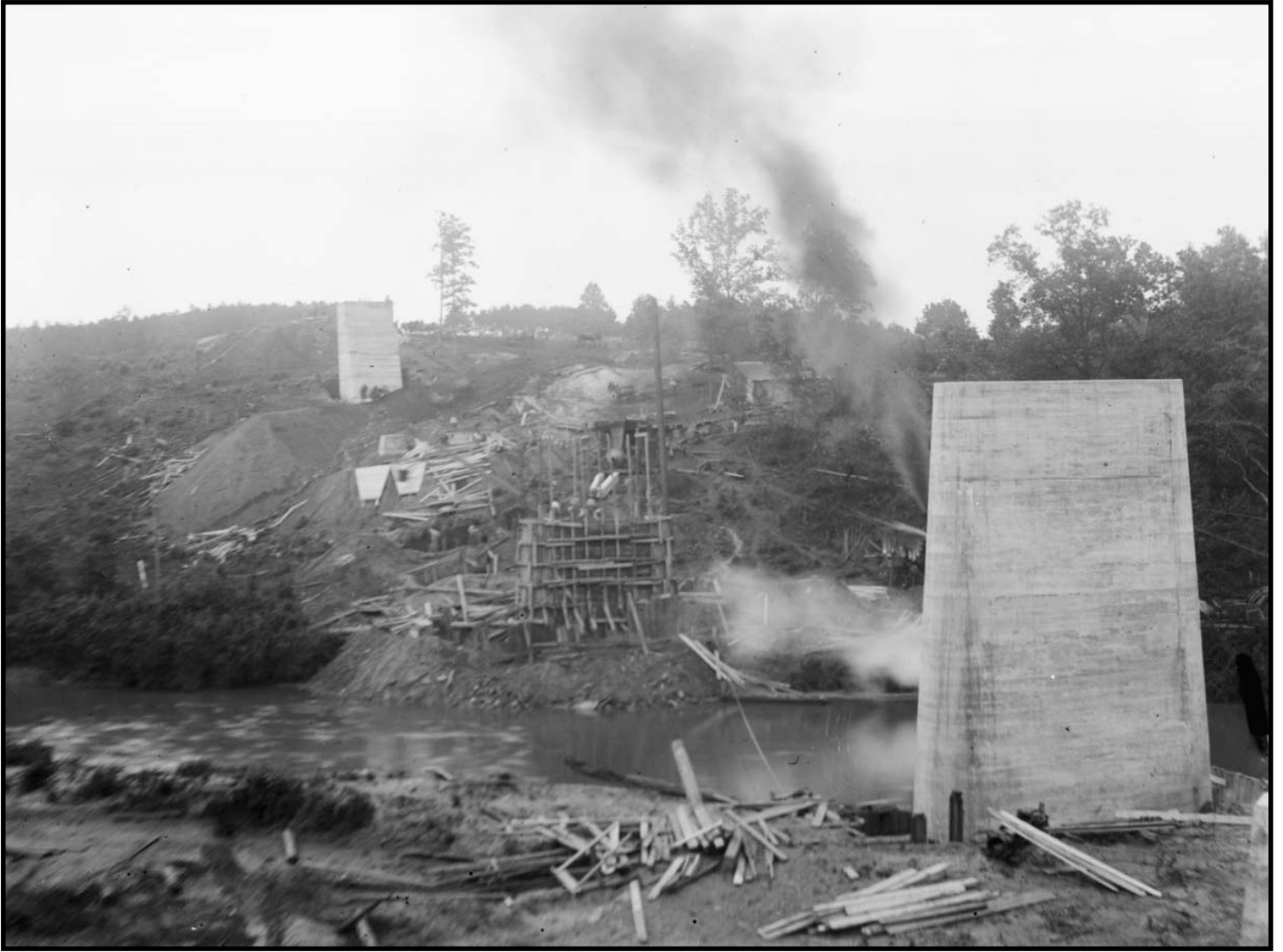
Pacolet River bridge masonry from South side of river (7/7/1909).