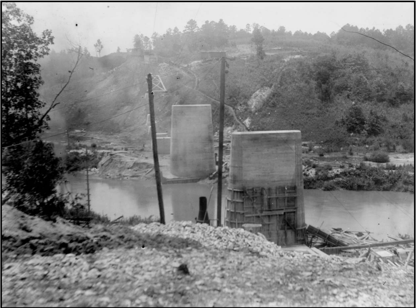
Starting erection of steel on Pacolet River bridge (7/28/1909).