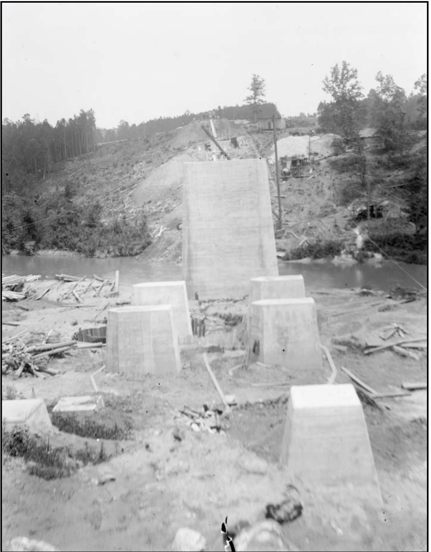
Pacolet River bridge masonry from South End (6-8-1909)