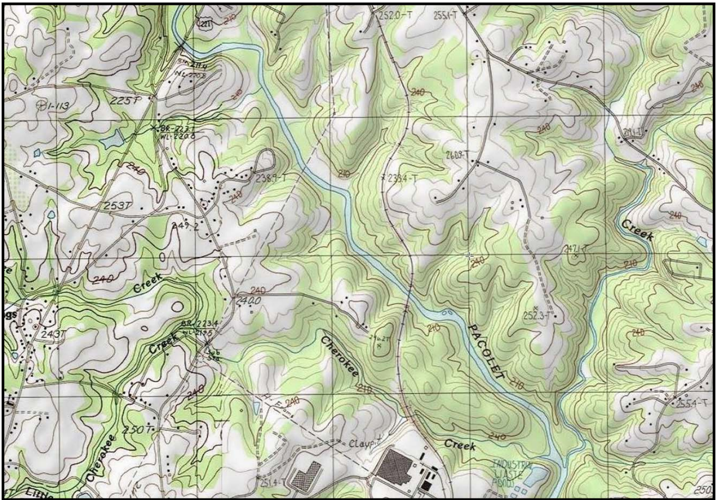
Topographic map showing the route of the railroad and the bridge across the Pacolet River .

The Clinchfield Railroad has had a variety of names. Originally chartered as the Charleston, Cincinnati & Chicago Railroad in 1886. In 1893 sold by bond-holders to the Ohio River & Charleston Railroad, which reorganized in 1902 as the South & Western Railroad, and in 1908 changed its name to the Carolina, Clinchfield & Ohio Railroad. In 1924 it again reorganized with the final name of the Clinchfield Railroad Corporation. Ultimately bought by CSX Transportation, Inc. who owns it today.