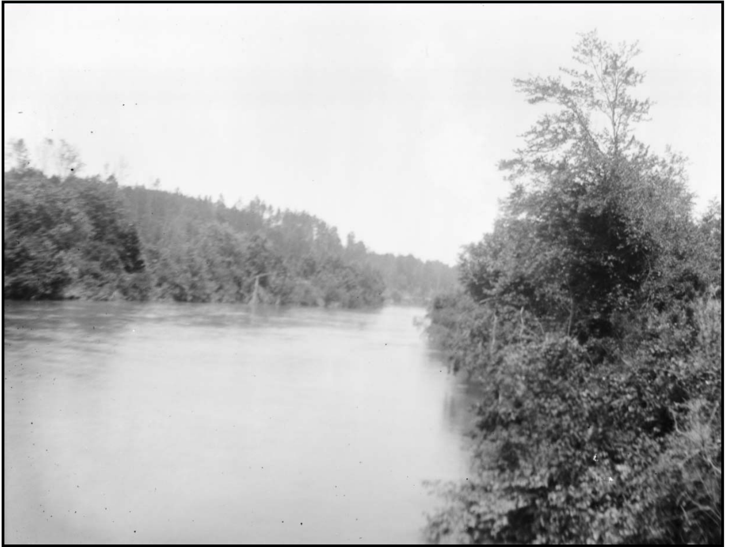
Looking up the Pacolet River from the bridge location.