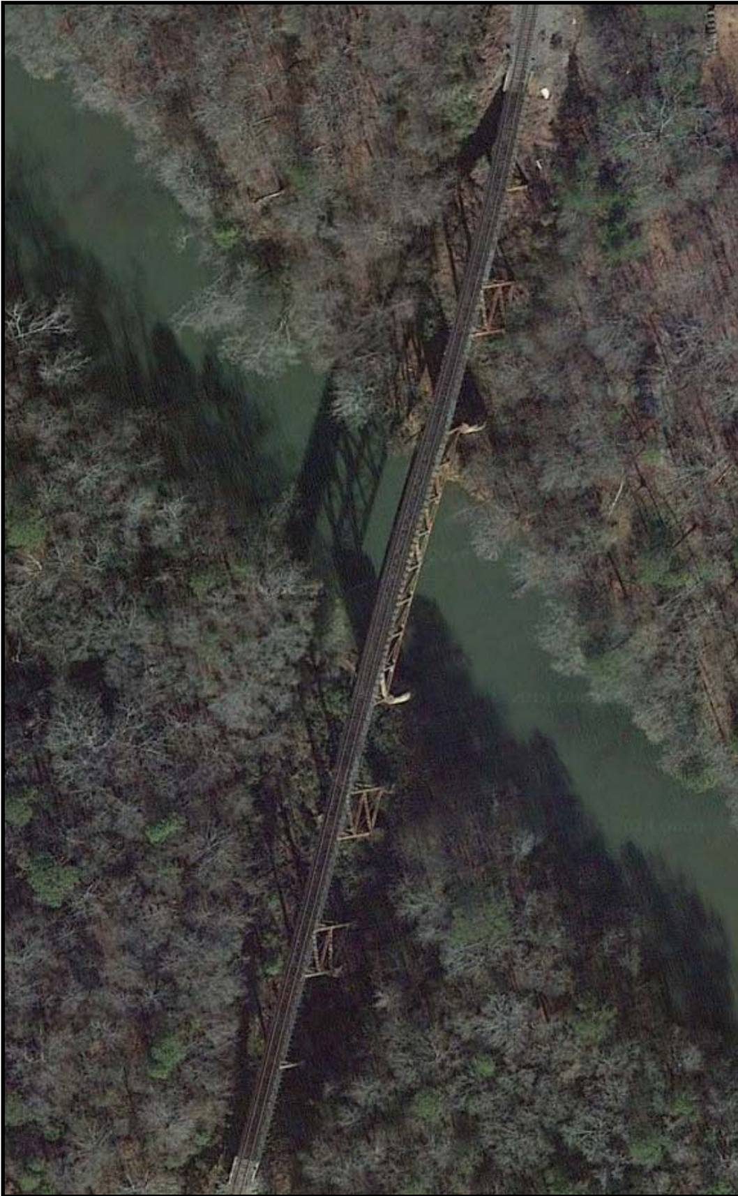
This is a satellite view of the railroad bridge as it appears today.