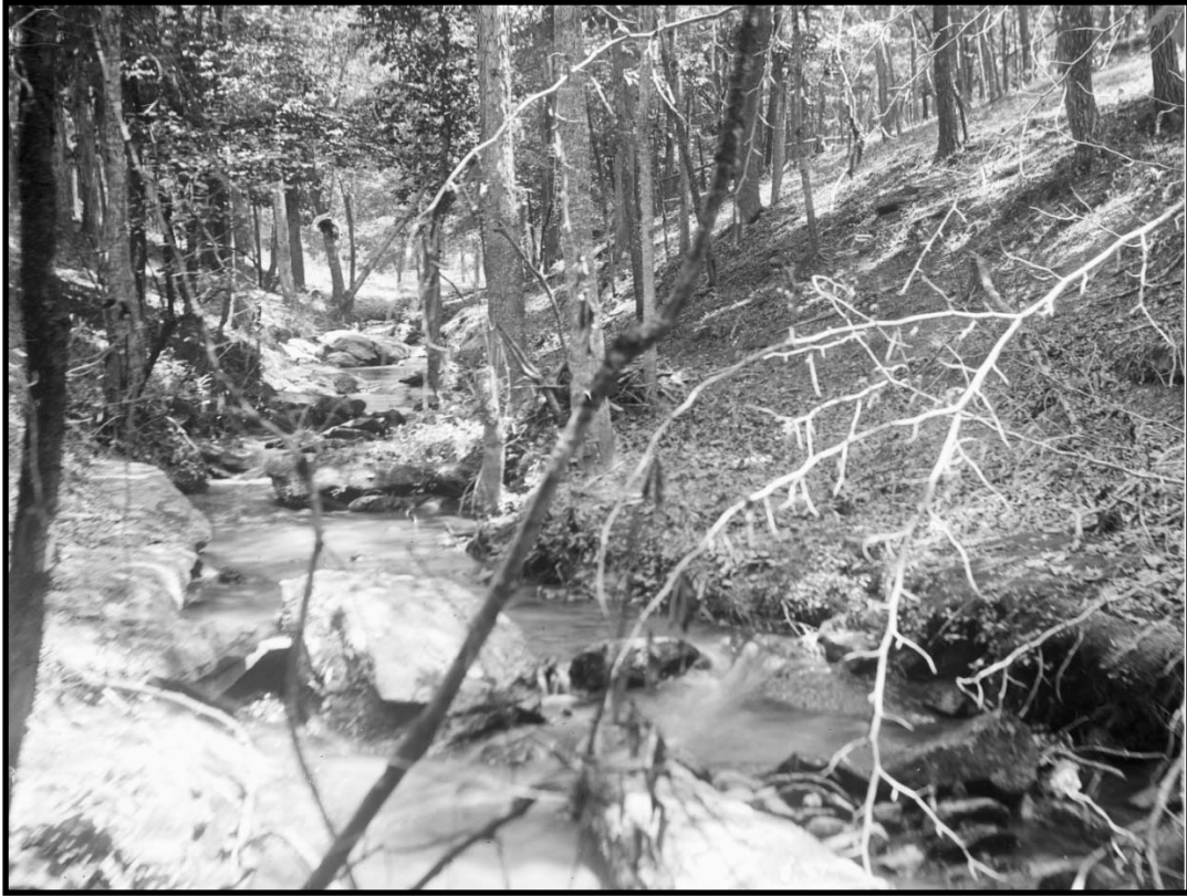
Small creek that enters Pacolet River near the bridge location. This is thought to be either Cherokee Creek or Island Creek.