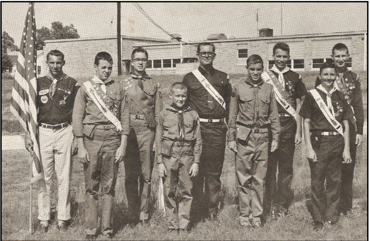
COLOR GUARD OF TROOP 151 AND 166