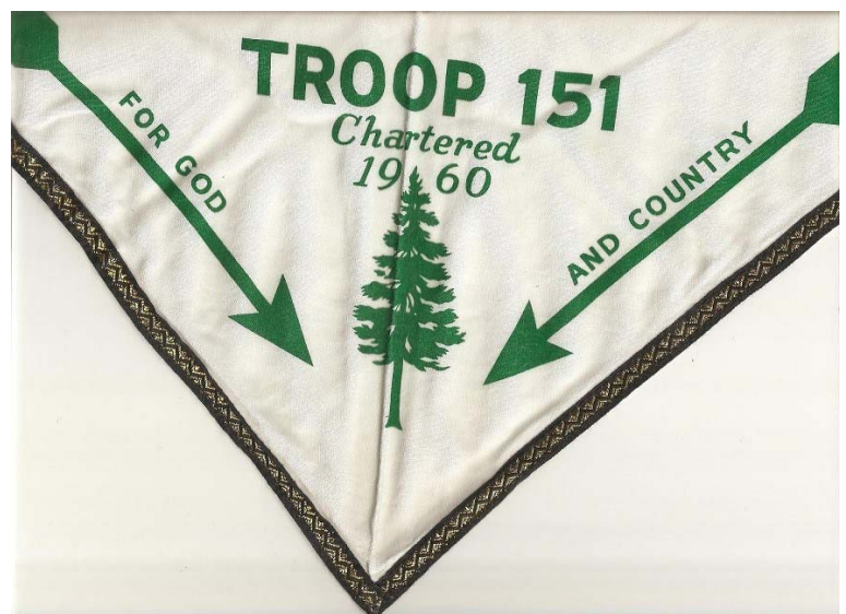
Scout Neck Scarf - Especially Designed for Troop 151