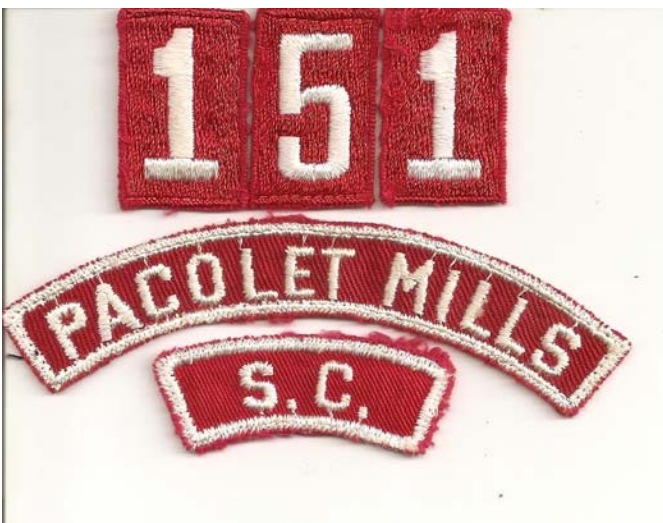
Insignia of Troop 151