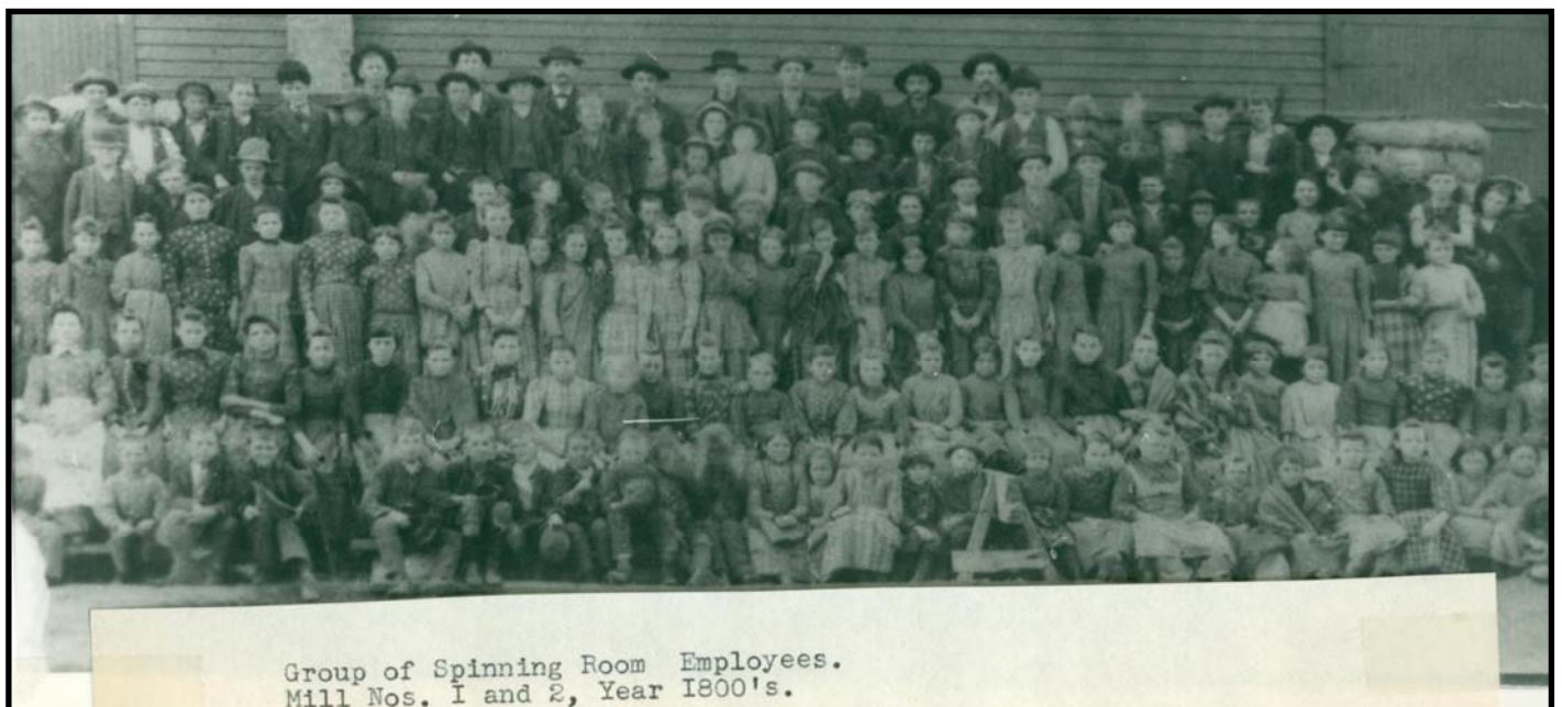
Group of Spinning Room Employees. Mill Nos. 1 and 2, Year 1800's.

The picture below was taken of workers at Pacolet Mills No.1 and No. 2 in the 1800s. Note that about half of the workers are children, some of them very young. It is a distinct possibility that one of these little workers is my grandfather.