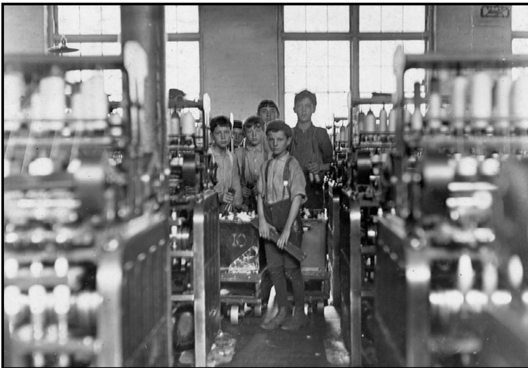
Young boys in Mollahan Mills in Newberry, South Carolina, on December 3, 1908.