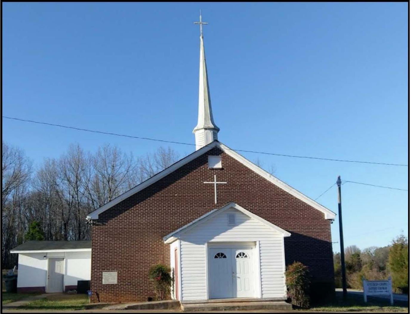
This is a present-day picture of the Knuckles Chapel Church. The church was not built until well over 100 years after the Battle of Cowpens. However, the place where it sits was a witness to some of the most historic scenes that ever happened in South Carolina.