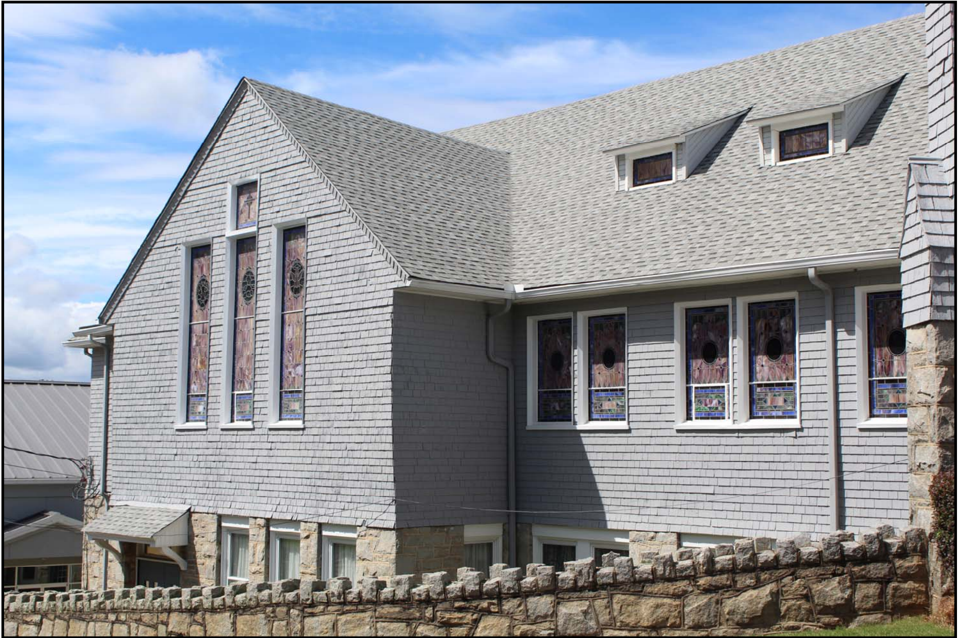
A side view of the church showing some of the stained-glass windows.