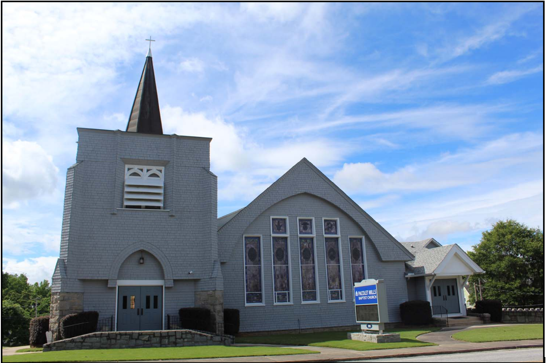
The front of the Pacolet Mills Baptist Church .