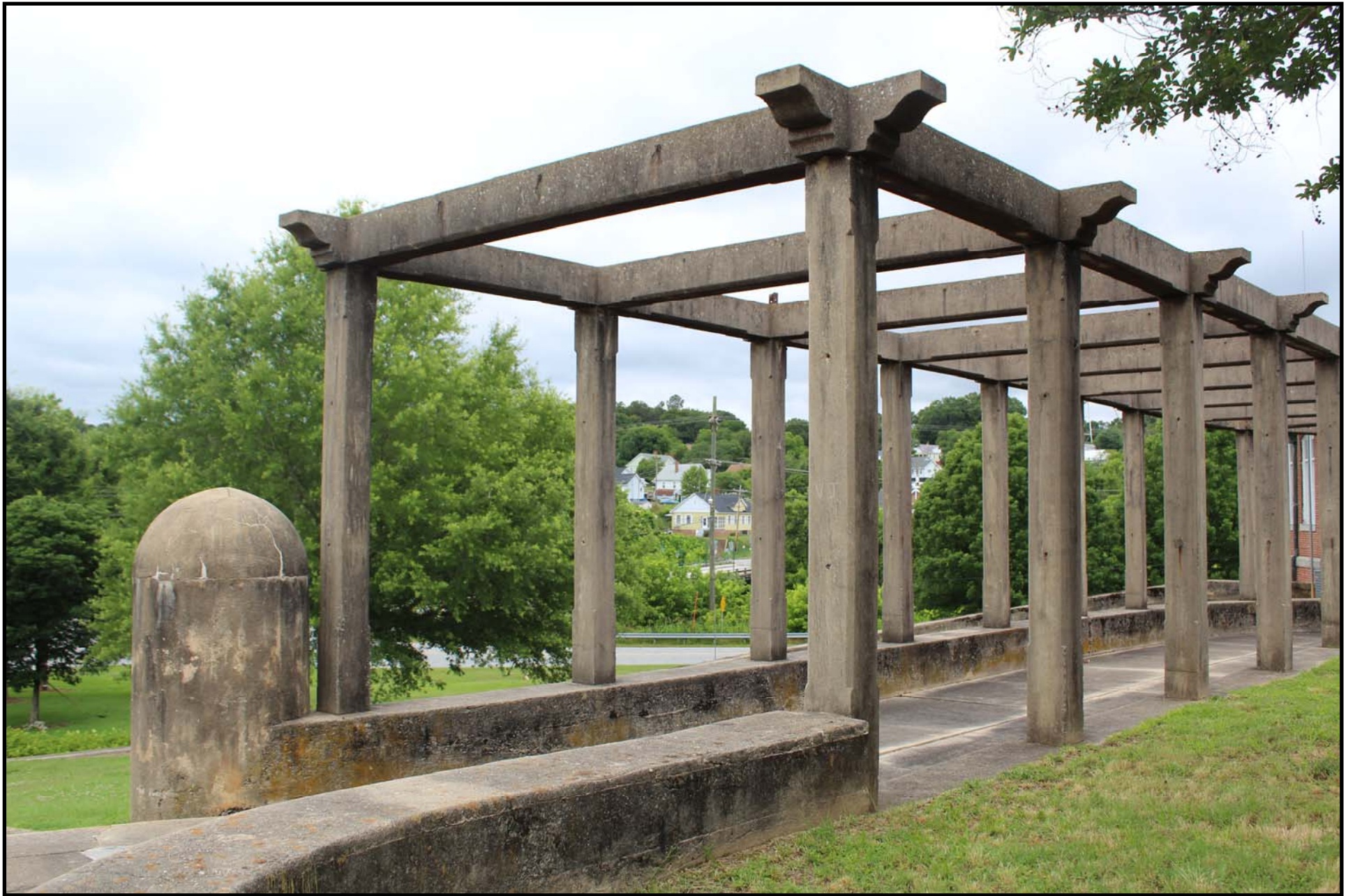
Another view of the pergola from a slightly different angle.