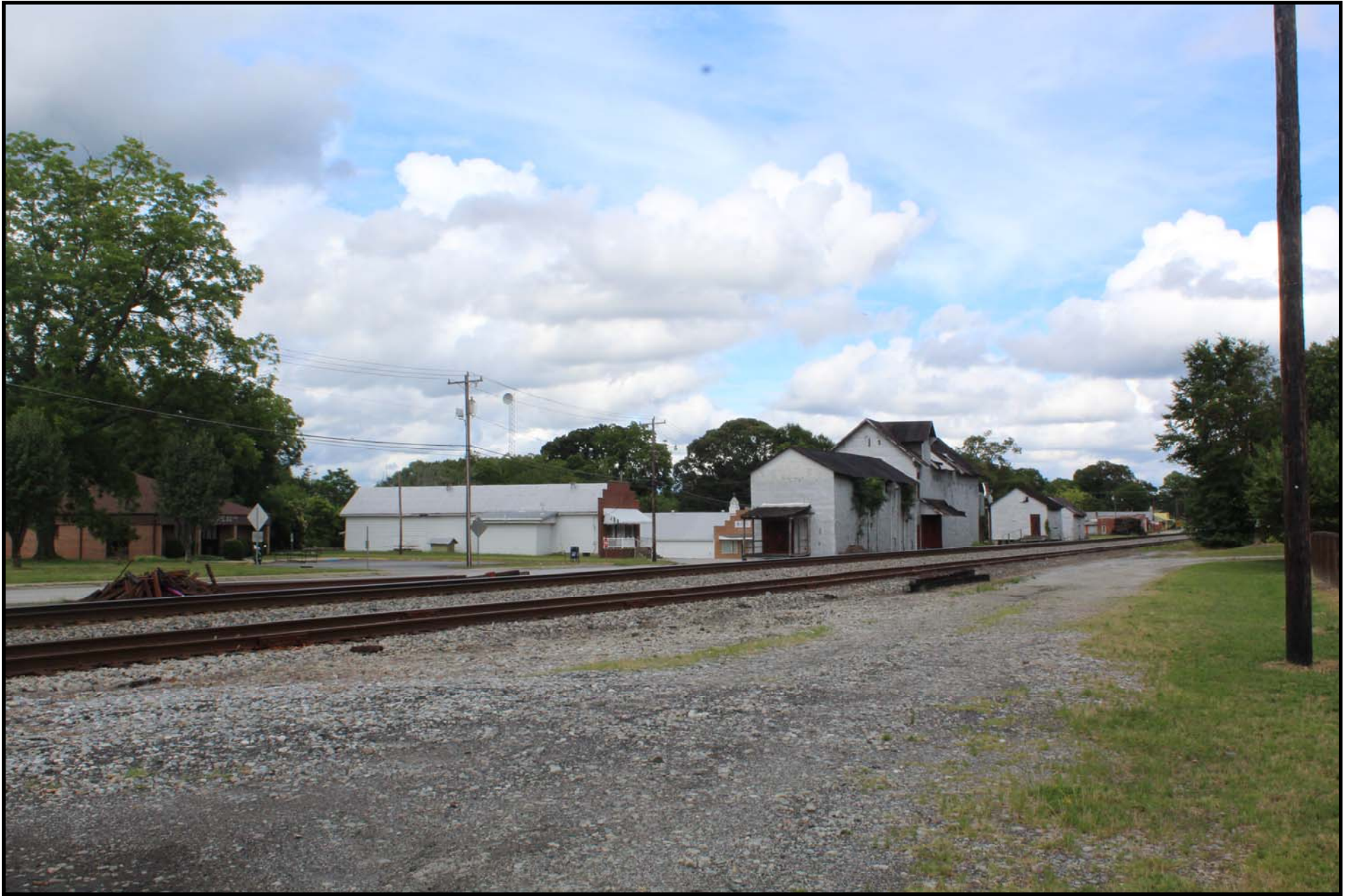
This view in Pacolet Station looks down the railroad tracks at the Old Cotton Gin on the right, the former Brown's Store in the middle and the present post office to the left.