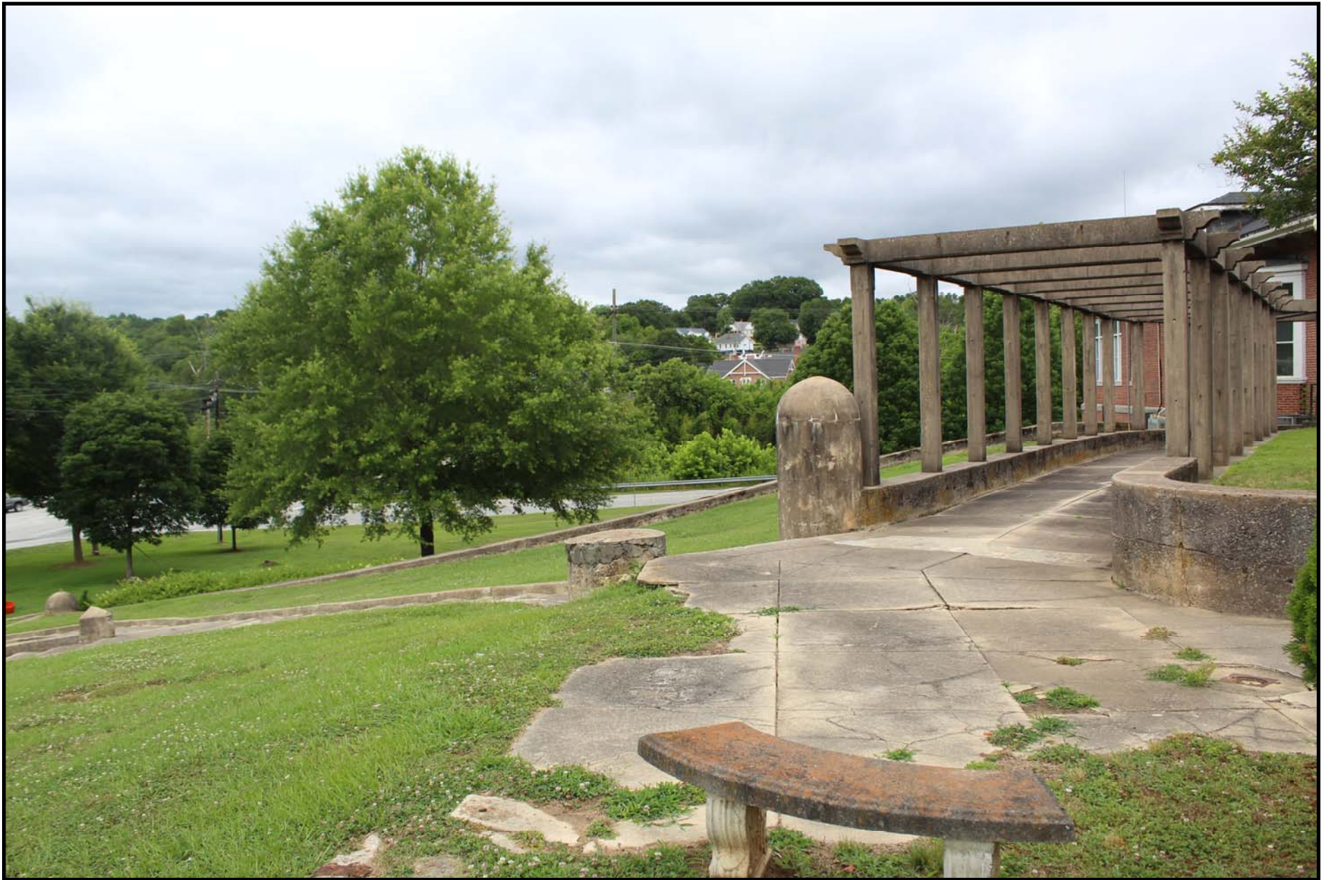
Another view of the pergola. The Montgomery Memorial Methodist Church can be seen in the distance across the Pacolet River . The “Crooked Steps”, to the left, lead down to The Flat and The Girls Club .