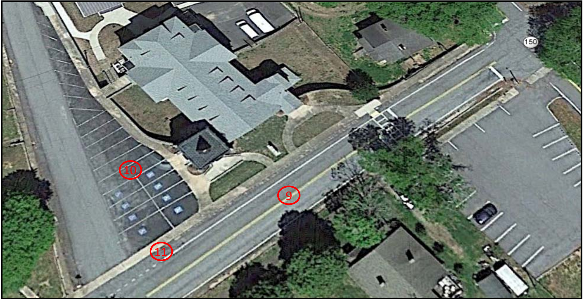
This Map shows the page number where the photos were made.