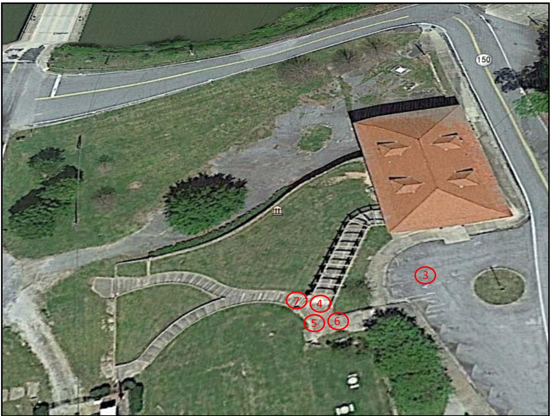
This Map shows the page number where the photos were made.